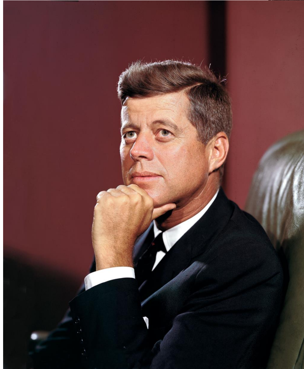
President John F Kennedy